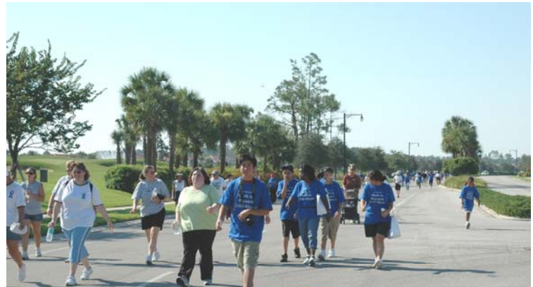
Over 550 walkers hit the streets in support of child abuse prevention.

With the help of these committed walkers, we can begin to fulfill the vision of a community free from abuse and neglect. The Children's Network of Southwest Florida