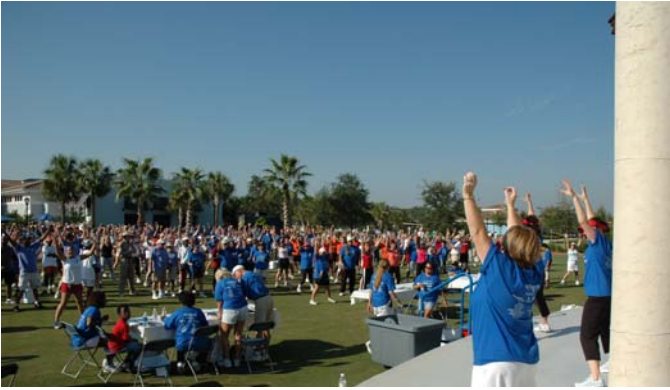
during warm up exercises at the beginning of the day.

The Children's Network of Southwest Florida hosted its First Annual Walk to Prevent Child Abuse at Pelican Preserve on September 30, 2006. This walk was designed to raise funds to create child abuse prevention programs as well as to fulfill the needs of some 1500 children currently under our care who have suffered from abuse or neglect. In July, there were a total of 870 calls to the abuse hotline. In Lee County alone, 521 people reported suspected abuse or neglect to the abuse hotline. These numbers reflect the urgent need to increase child abuse prevention. Over 550 walkers came out to support this cause.