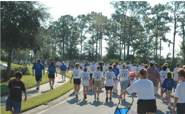
Chico's Charities created their own team shirts for the event as well as had the largest corporate turn out that day.

would like to thank our four main sponsors: Chico's Charities, Publix Supermarket Charities, WCI Communities, Inc., and the News Press for their major contribution. We would also like to thank Pelican Preserve for hosting the event and lending numerous volunteers to the cause. With the help of many other local community organizations sponsoring the event, the First Annual Walk to Prevent Child Abuse was a huge success. Thank you to all of the walkers and volunteers that helped make the day so special!